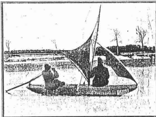
SQUARE-END SCOW FITTED UP AS A "SCOOTER."

One of our illustrations also shows a square-end scow fitted up as a scooter. This boat is a home-made affair, and, to be properly steered, requires the use of a rudder. The rudder, it will be observed, consists of a metal blade secured to a pole in such a manner that when in water it can be used as an oar blade, and when out of the water its edge will cut into the ice, thus affording a suitable means for steering the boat.